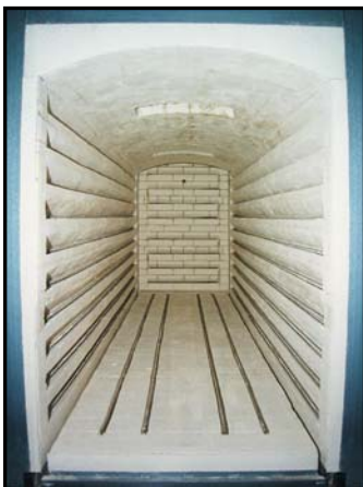
Insulating Fire Brick (IFB) Lining

*Specifications are approximate and subject to change without notice. (Add Suffix: i.e. G = 900°C , H = 1340°C , HT = 1400°C)