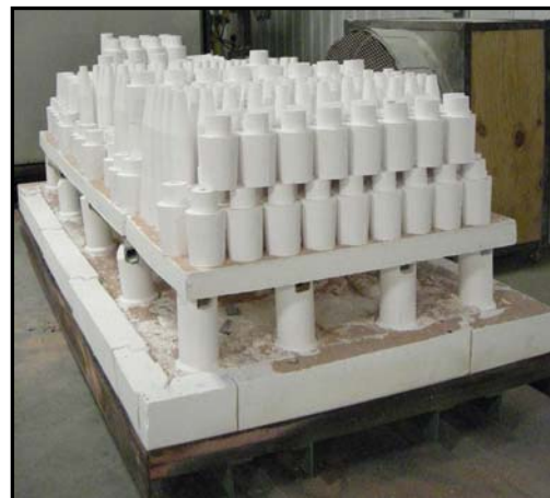
High Product Density Loading Capability